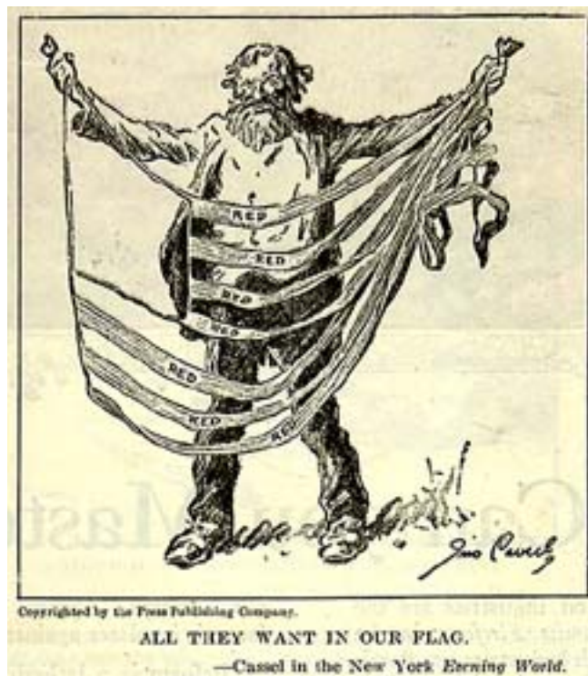
1.3 – “All They Want in Our Flag;” Cassel, 1920.