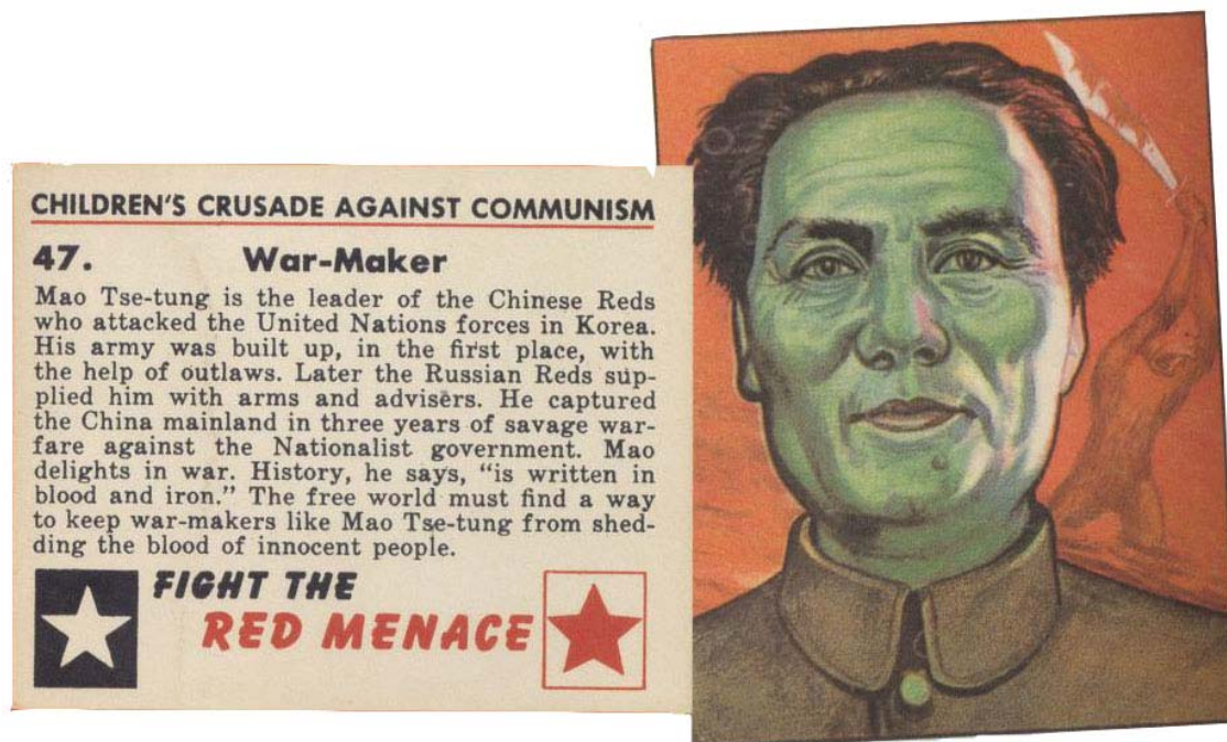
2.2 – “War-Maker;” Bowman Gum, Inc., 1951.