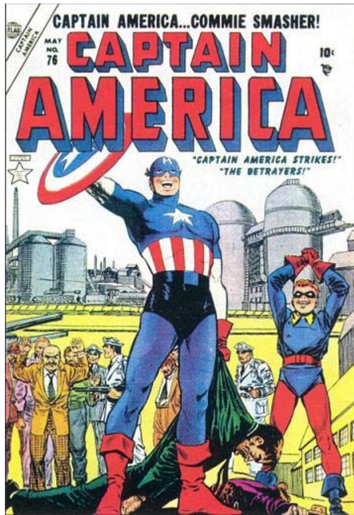
2.3 – “Captain America...Commie Smasher!” Marvel Comics, 1954.