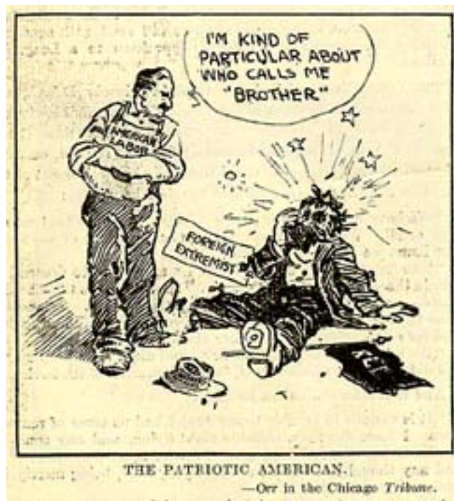
1.1 – “The Patriotic American;” Orr, 1919.